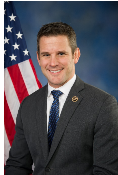
Rep. Adam Kinzinger