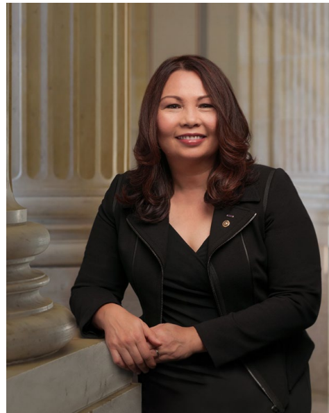
Sen. Tammy Duckworth